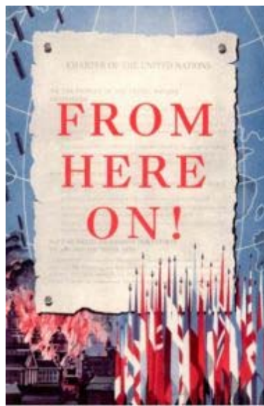
rotary's presentation of the United Nations charter. "From Here On!"

During World War II, Rotary informed and educated members about the formation of the United Nations and the importance of planning for peace. Materials such as the booklet From Here On! and articles in The Rotarian helped members understand the UN before it was formally established and follow its work after its charter.