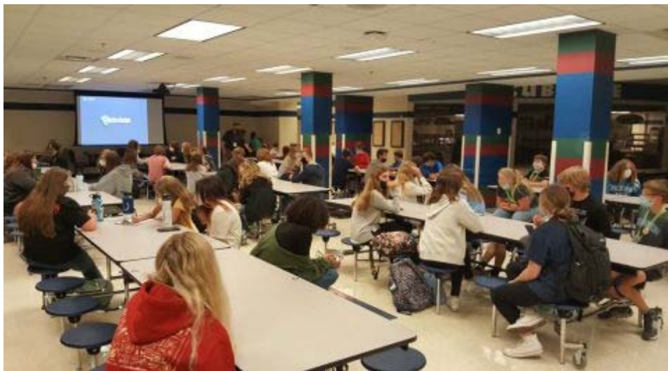
The middle school cafeteria is full for the organizational meeting.