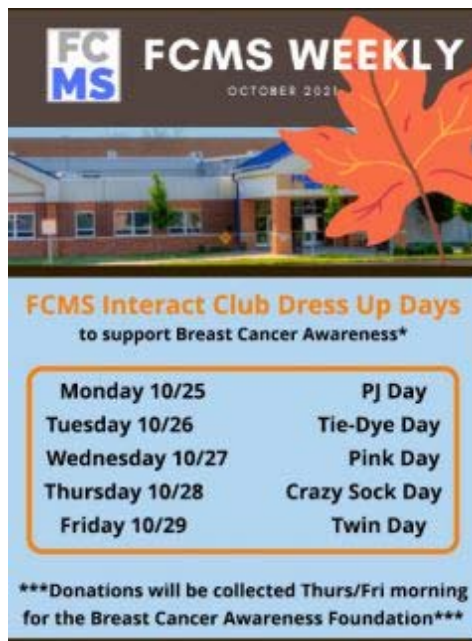
First Service Project flyer.