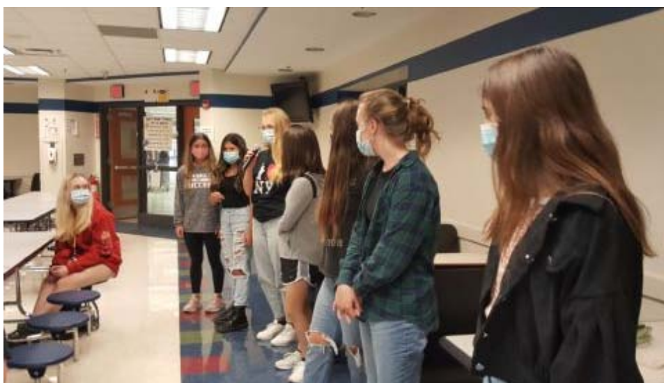
High School Interactors introduce themselves to the middle schoolers.